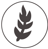
1. CEREALS CONTAINING GLUTEN*

NEXT TO THE NAME OF EACH DISH YOU WILL FIND THE NUMBERS CORRESPONDING TO EACH ALLERGENIC INGREDIENT, BASED ON THIS TABLE.