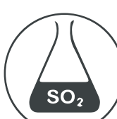
14. SULPHUR DIOXIDE (SULPHITES)